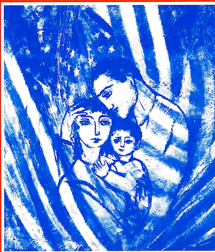
Illustration by: Eszter Gyori

Florida Immigrant Advocacy Center, Inc. 3000 Biscayne Boulevard, Suite 400 Miami, Florida 33137 Tel 305-573-1106 Fax 305-576-6273 www.fiacfla.org